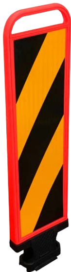
Assembled Traffic Lane Separator